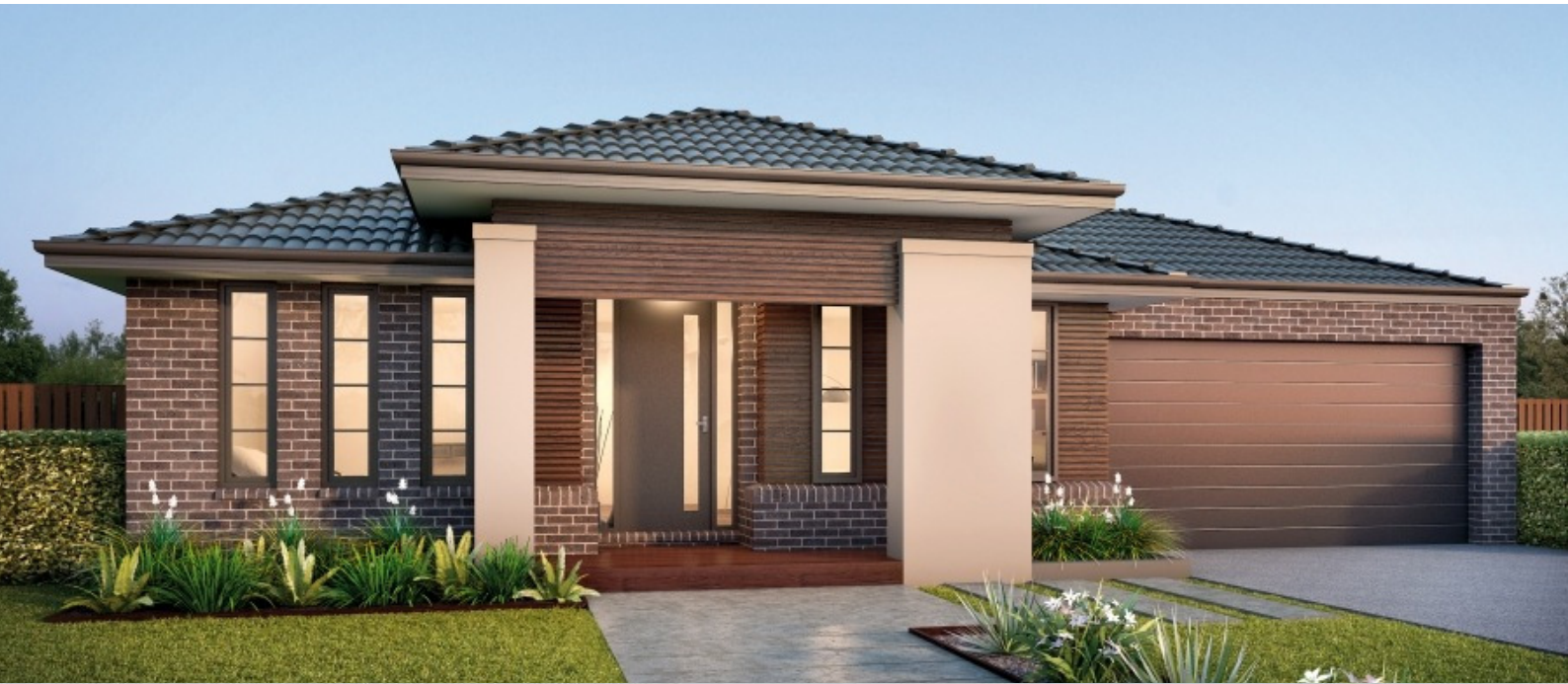
Image depicts items not supplied by Metricon namely landscaping, fencing, timber decking and paths. Image contains upgrade items.