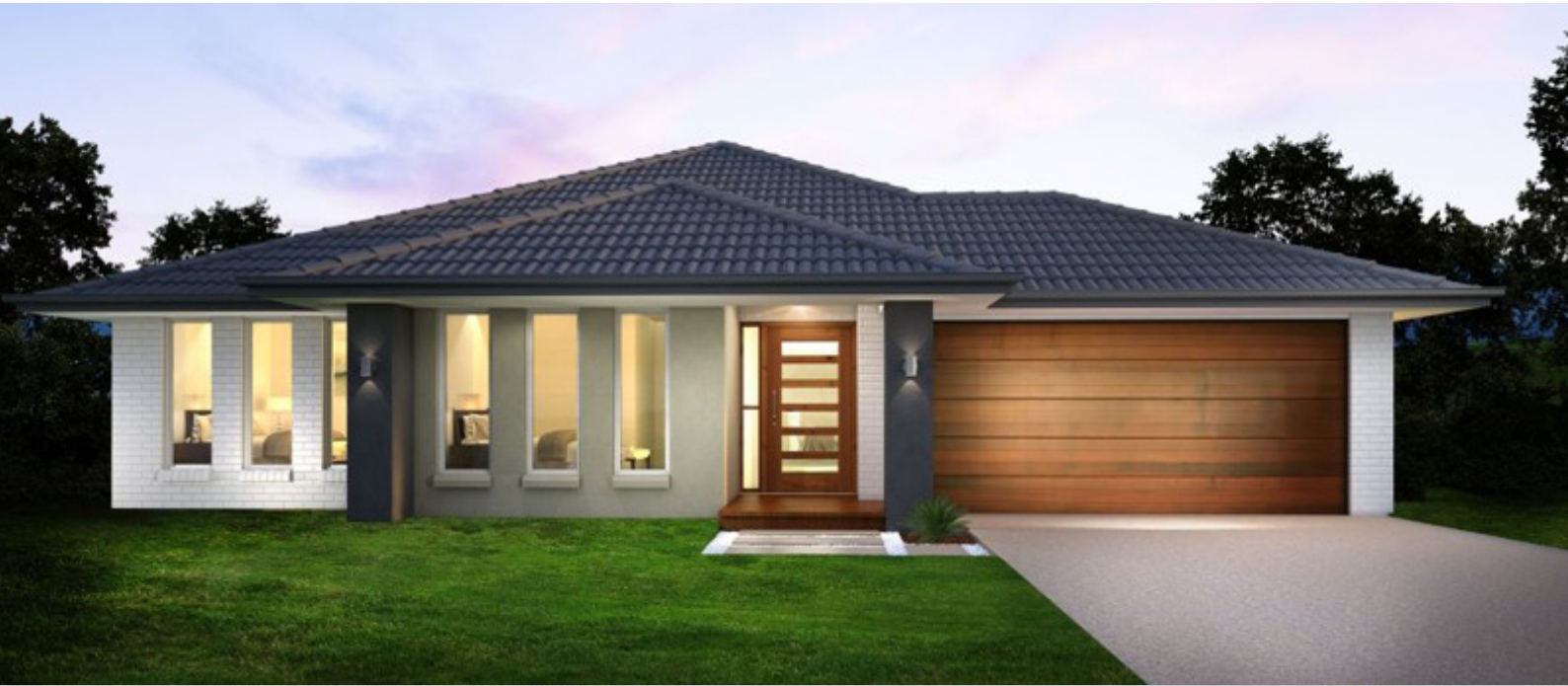
Image depicts items not supplied by Metricon namely landscaping, fencing, timber decking and paths. Image contains upgrade items.